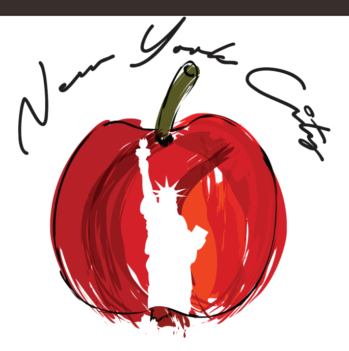
American Probation and Parole Association